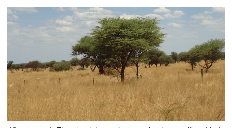
After harvest: The cheetah needs open landscape like this to successfully hunt. Research is being conducted on the effects thorn bush removal has on the soil composition and wildlife density.