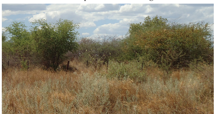
Before harvest: CCF's habitat restoration efforts focus on clearing thickened thorn bush from cheetah habitat. While thorn bush is a native plant, due to the decline of large grazers, the plants become overgrown, clogging the landscape.

The biomass potential in central Namibia is enormous, with abundant thorn bush resources in an area with unemployment and limited electricity. CCF's extensive research supports the sustainable and responsible harvesting of this resource.