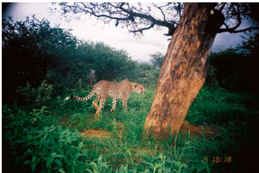
Fig. 2. Cheetah captured at a playtree (Photo CCF).

below the capture probability threshold of 0.30 for populations of up to 100 (Otis et al. 1978). This finding is due to the observed high re-visitation rate of playtrees. Marnewick et al. (2005) had a similar visitation rate on their study.