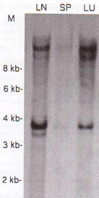
FIGURE 2. Identification of feline leukemia virus in tissues from a cheetah with lymphoma. Total cellular DNA was extracted and analyzed by Southern transfer and hybridization using the FeLV exU3 probe. LN, SP, and LU correspond to lymph node, spleen, and lung, respectively. The relative molecular mass of DNA (M) is shown in kb pairs. The FeLV internal virus band migrates at 3.65 kb.

from Cheetah #2 to Cheetah #1 is assumed to have been via saliva through the enclosure fence. Food dishes, direct physical contact, and other traditional means of FeLV transmission were unlikely, because preventive hygiene practices were in use. The animals were housed in adjacent enclosures because the risk of transmission was thought to be low without direct contact and with known viral lability.