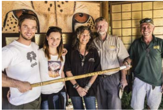
Anna Fenninger at CCF Namibia for her Calendar shoot!

Also in February, CCF launched an initiative aimed at athletes. HUMANS FOR CHEETAHS is a CCF charity team that can be part of any athletic event around the country for runners, walkers, bikers, and other racers that allows charity teams. HUMANS FOR CHEETAHS will make its debut on Sunday, 18 May 2014 at the Portland Rock n' Roll Half Marathon.