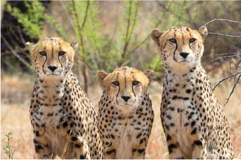
The cheetahs known as “The Wild Girls” -- Emma, Jacomina, and Minja prepare for their re-wilding.

When the gate opened on Monday 23rd December into CCF’s soft release camp, Minja, Jacomina and Emma were about to face life on their own, in the wild. Each of them had been fitted with a GPS tracking collar. All three of these cheetahs came to CCF as orphans when they were young. A great deal of preparation went into this moment, the second rehabilitation of resident cheetahs at CCF in the past three months.