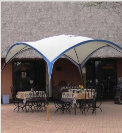
Sheltered outdoor seating at CCF's Cafe

We continue to work with our insurance company to recover the cost of rebuilding. They have provided us partial funding to begin re-printing our education books and purchase some of the necessary day to day equipment (our kitchen items, for instance) that was lost in the fire.