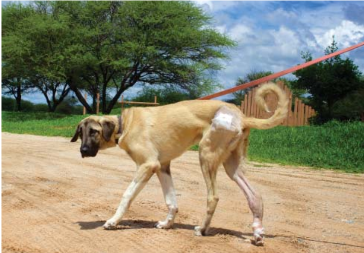
CCF brought Lucky back to CCF to receive treatment and recover from injuries he sustained from being hit by a car while crossing a road.

At CCF we provide our Livestock Guarding Dogs to dozens of farmers every year, and these dogs grow into fierce protectors of their herds. But our work doesn't stop once a puppy is placed with a farmer. We keep up with our dogs, assuring that the dogs we've placed are doing well.