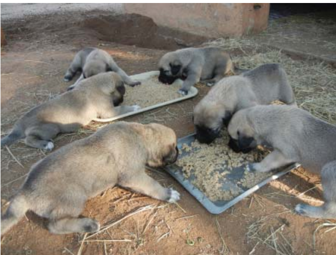
Hediye's Kangal puppies are growing fast, and will soon join the ranks of CCF's Livestock Guarding Dog Programme

Cheena is not the only successful breeding this spring at CCF. Hediye, one of CCF's Kangals, is now caring for six puppies – four males and two females. The puppies are all doing well, are eating solid food and beginning to take their first halting steps on the path to becoming the next generation of Livestock Guarding Dogs. We're also waiting for news on the breeding between male Firat and female Kiri, two Kangals. Anatolian Pinda is also pregnant. CCF's careful attention to breeding is part of why our dogs are so successful in their tasks of guarding livestock herds, and why Namibian farmers are willing to stay on a two year long waiting list for a CCF dog. Puppies are placed at 10 weeks after neutering and shots. Regular follow-up care is also provided, especially during the first two years.