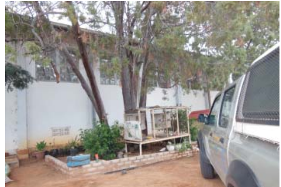
This is where we found Rainbow when we arrived at the farm

Assuring the health and survival of the cub became first priority on her arrival at CCF. We took her blood to help evaluate her condition. She was weighed and measured – a scant 5 kilograms, which is very thin for what we believe is a four month old cub. Next she was given meat and calcium supplements. Given her nearly starved state, she needed small meals to aid her