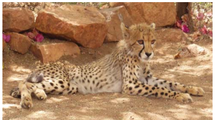
Rainbow is doing well now. She recently weighed in at 9kg.

While she is not fully restored to health yet, she is growing stronger. Rainbow is proving to have the temperament of a normal cheetah cub, hissing at humans, but growing acclimated to the Centre, and to the presence of other cheetahs. Usually, a cub separated from her mother at an age as young as Rainbow's regrettably can never be returned to the wild. Eventually, Rainbow will be integrated with our other resident non-releaseable cheetahs. CCF will always answer a call from a farmer to rescue a cheetah, and we're glad we are able to give Rainbow a safe home.