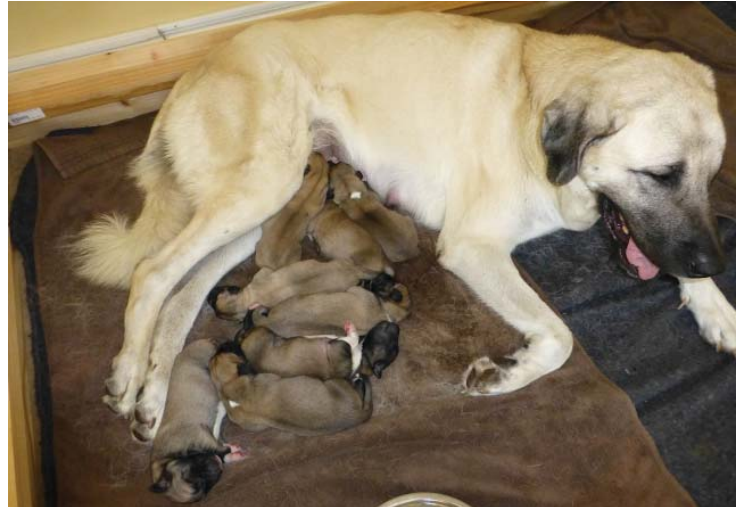
CCF's very special dog, Cappuccino, with her new litter of puppies.