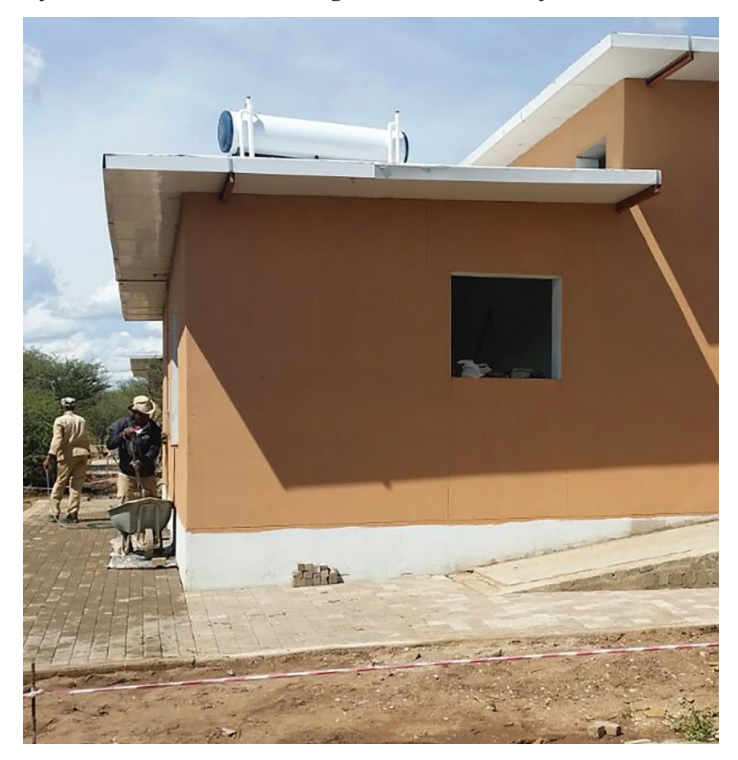
photo top: Illustrating the theme of the 2018 Pathways conference "Living with Wildlife" an oryx on the conservancy at CCF in Otjiwarongo bottom photo: Work in progress, CCF's new Cheetah View Lodge nears completion, scheduled to open this year..

In addition to cheetahs, guests many also see other African species that live on CCF's lands. The new Lodge boasts a spectacular view of the Waterberg Plateau, and its private dining room overlooks a waterhole that draws baboons, jackals, oryx, steenbok, and a variety of birds. Guests will be enchanted by scenery that is straight "Out of Africa" while enjoying their meals, which will be prepared, quite literally, from "farm to table." Many of the vegetables and meats served to guests will come from CCF's model farm (grown with organic methods), and the Feta and Chevre cheeses and ice cream will be made by CCF's onsite Dancing Goat Creamery.