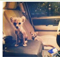
Cheetah advert on social media.