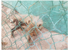
Cheetahs confiscated in northwestern Somalia, Aug-Sep 2018. (c) Cheetah Conservation Fund.*