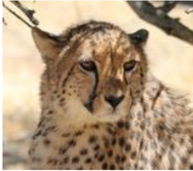
1. Female/2 years-old