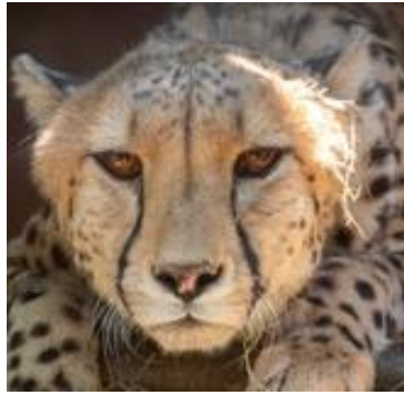
2. Female/3-4 years-old