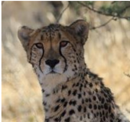
4. Female/5 years-old