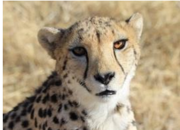
5. Female/5 years-old