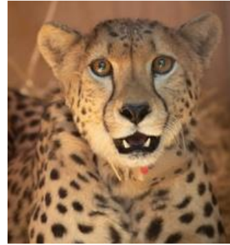
3. Female/2.5 years-old