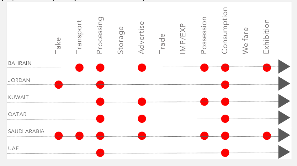
Figure 3: No GCC country explicitly criminalizes all activities along the entire trade chain for illegally sourced wildlife . Specific acts of 'processing, 'possessing,' and 'consuming' illegally sourced wildlife, for example, are not expressly criminalized in any. Table shows acts not mentioned.

Protection for species is not provided through a single national list of protected species but rather through several lists under different laws with different purposes. This is not uncommon but creates potential for gaps and conflicts . All countries in the GCC include cheetahs in at least one list.