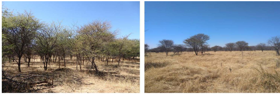
Figure 3 Representative photographs of non-thinned (left) and previously thinned (right) plots showing differences in vegetation structure on farm Elandsvregude (#367) in north-central Namibia in 2020. Non-thinned plots have higher tree/shrub density, tree/shrub cover, limited habitat visibility and less grass cover than thinned plots.

Soil samples were dried at a temperature not greater than 35°C and were sieved to 2 mm to obtain a fine earth fraction for analysis. Extractable cations (Ca, Mg, K and Na) were obtained by extraction with 1 M ammonium acetate at pH 7 and were measured by atomic absorption spectroscopy. TN was determined by introducing the samples to the furnace containing only pure oxygen, resulting in a rapid and complete combustion (oxidation). Nitrogen present was oxidized to NO x , respectively. The NO x gases were passed through a reduction tube filled with copper to reduce the gases to N and onto a thermal conductivity cell (TC) utilized to detect the N 2 . Available P was determined using the Olsen method: extraction was done with sodium bicarbonate; phosphate was measured spectrophotometrically using the phosphomolybdate blue method.