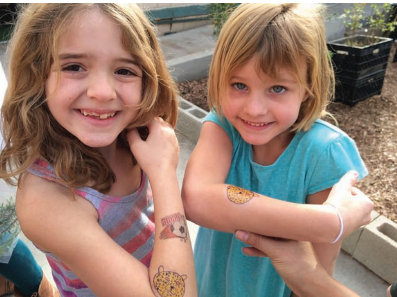
ABOVE: We're thrilled to have cheetah fans of all ages! Valley Charter School in California decided to help CCF by designing and selling temporary tattoos. They came up with a plan of action and followed through to raise over $700! These pint-sized philanthropists created tattoos of the animals they studied in class: panda, shark, rhino, tiger, polar bear and cheetah. Wasn't that a great idea? Thanks Valley Charter!

Nonprofit Org US Postage Paid Capitol Heights, MD Permit # 4168