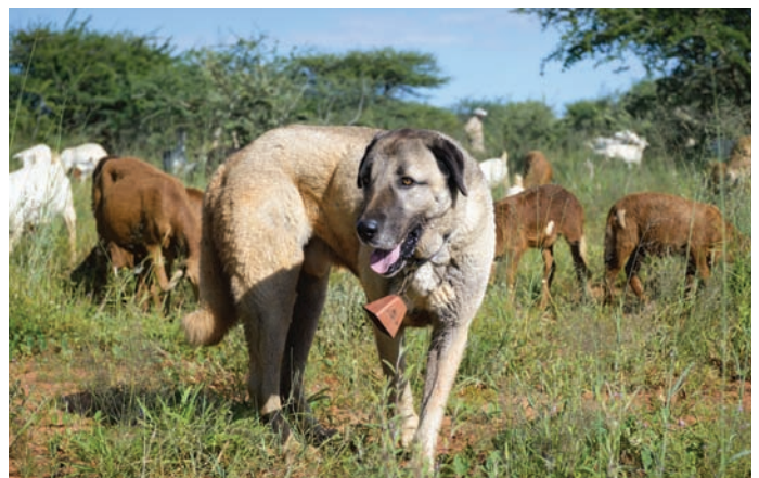
At top, Penda and her pups. Middle, Kiri’s litter before they went to their new homes on commercial or communal Namibian farms. At bottom, the dream for these puppies—to become working Livestock Guarding Dogs and protect herds from natural predators.

To sponsor a Livestock Guarding Dog visit www.cheetah.org and view ‘Sponsor a Dog’ under ‘Donate’.