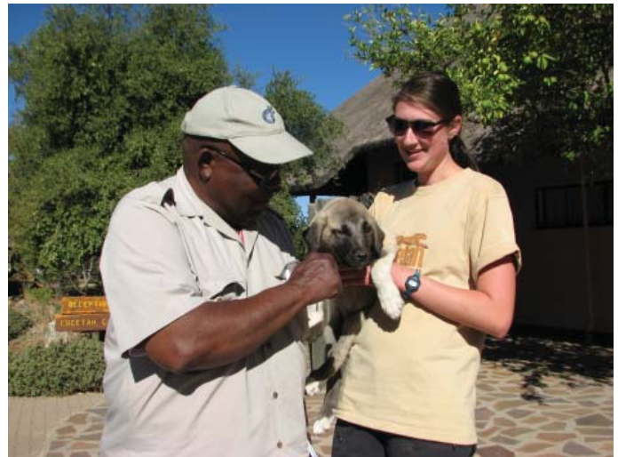
A Namibian farmer with his Livestock Guarding Dog on "Puppy Day" -- when puppies are placed with their new homes.

Farmers who are lucky enough to obtain a CCF dog pay only a nominal fee for the dog, to promote a full sense of ownership, and must attend a day-long training course to teach them how to successfully train and deploy the