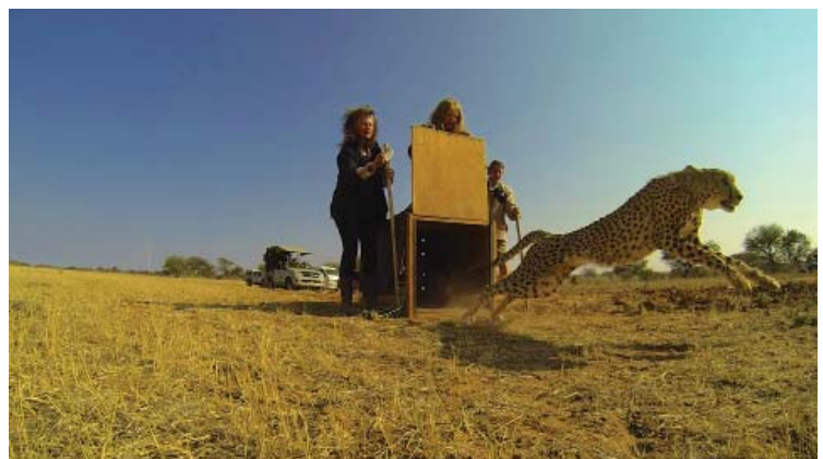
A recent release of a wild male -- over the years CCF has collected data from hundreds of wild cheetahs, and is a leader in research on the potential for rewilding captive cheetahs.

We estimate that the NamibRand female was about 10 years old, which is an average life expectancy for a cheetah living in the wild. And yet, she was in prime condition. She was raising her third litter in the NRNR, showing more tenacity than even her GPS collar. That collar taught us much about cheetah movements, ranges, and behavior. We mourn her loss, but remember her as a success story. Thanks, Supermom.