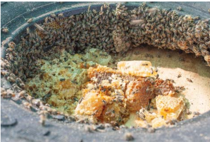
CCF's first beehive as part of its new apiary, makes use of an old tire.

That's why CCF joined a program by the Namibian Directorate of Forestry (DoF) to help farmers set up beehives. CCF began an apiary, using a beehive in a tire removed from a nearby farmer's garage. CCF's new bees are now settling in peacefully, and other swarms have been added.