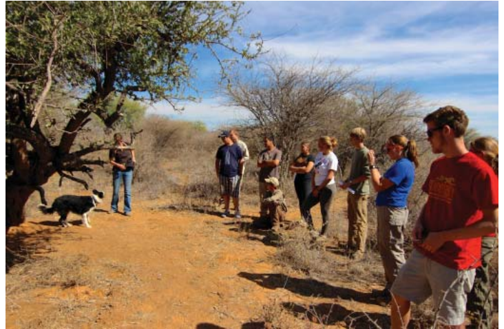
A group from National Geographic Student Expeditions learns about our scat-detecting dogs at CCF in Namibia.

CCF's commitment to education, however, is not confined to a classroom. CCF regularly hosts school learners at its overnight facility, Camp Lightfoot, and receives thousands of visitors every year, many of them including school groups from Namibia and