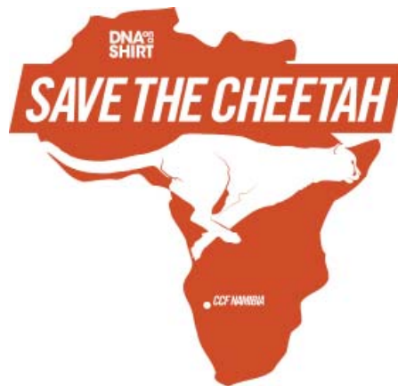
The graphic featured on the front of the special edition shirt available as part of DOAS's Indiego campaign.

The art pieces will be sold through the DNA on a SHIRT website with a portion of the proceeds going to CCF. DOAS has also launched an indiego campaign to finance its visit to CCF in Namibia to collect the DNA samples that the artwork will be derived from.