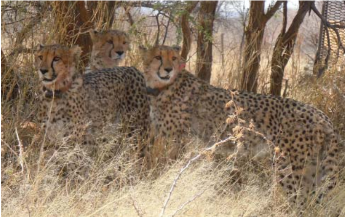
When CCF releases cheetahs back into the wild, we often use VHF or GPS collars to keep track of their activity and monitor their progress

Every time a cheetah dies it's a sad day for all of us at CCF, and for the entire species. But NamibRand Wild Female AJU 1576 (AJU is short for Acinonyx jubatus ), was special. We generally don't name wild cheetahs, but this amazing cheetah has been a "Supermom."